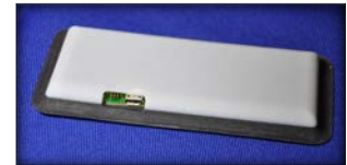
Embedded Arf Board